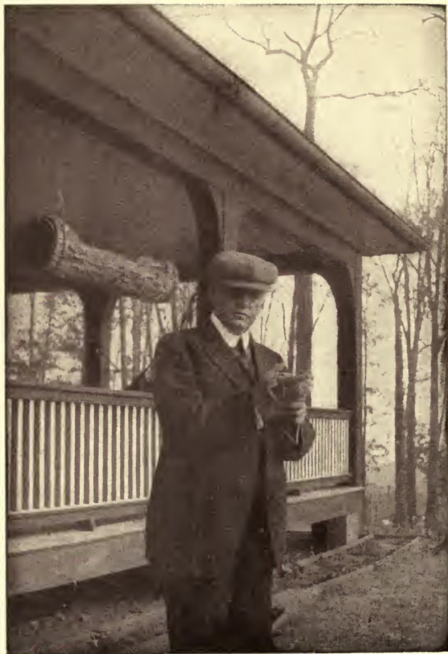
O. Henry in Asheville. A hitherto unpublished snapshot